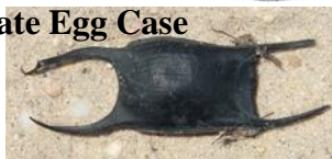
Skate Egg Case