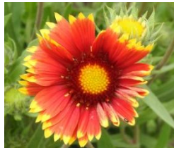
Gaillardia (Fire Wheel)